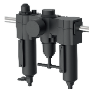
FRL (Filter Regulator Lubricator)